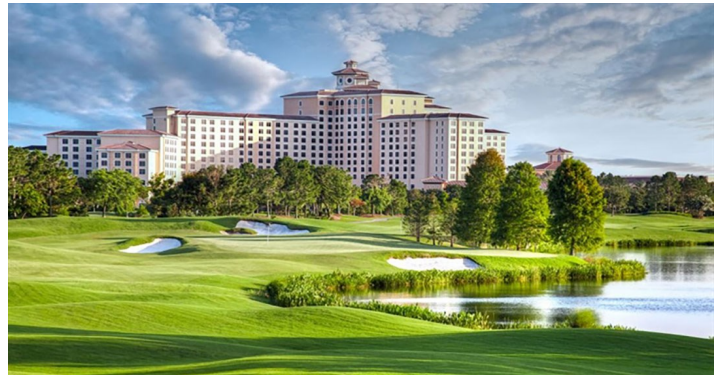
Rosen Shingle Creek Resort

Meeting NFRW members from across America and trading state pins is a highlight of the weekend.