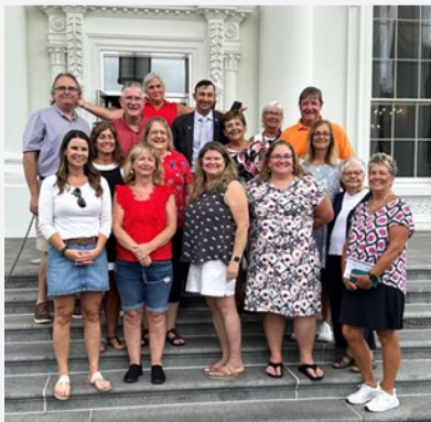
The members of our club at the White House tour exit.