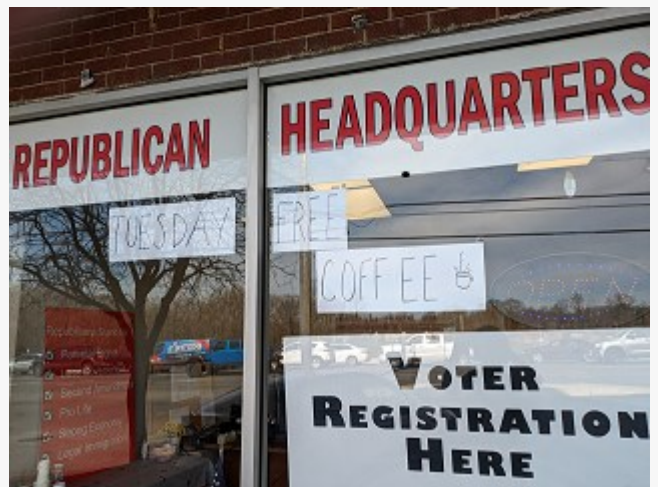
Calvert County Republican headquarters 424 Solomons Island Rd., Prince Frederick MD Open M-F 1-5p.m.

Finally, the RWLC opened a campaign headquarters for the upcoming elections where supporters can obtain candidate campaign materials. The office is staffed by RWLC and Calvert County Central Committee volunteers.