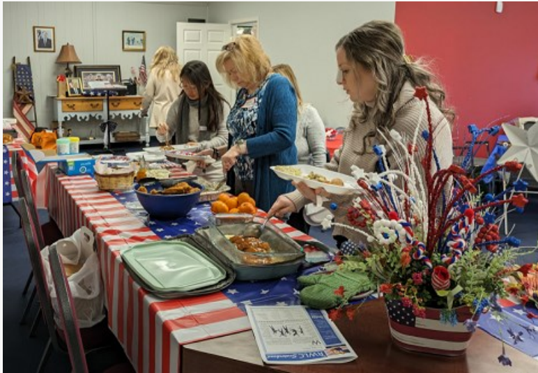
21st Anniversary of RWL of Calvert celebration