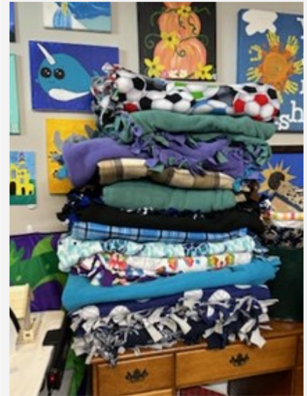
The 13 blankets that were made.