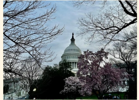
Washington DC's famous cherry blossoms beginning to bud on a beautiful Spring day.

On a gorgeous Spring Day in mid-March, MFRW leadership was well represented the NFRW Spring Board meeting in Alexandria, VA. Thursday's "Legislative Day" was actually held ON Capitol Hill for first the first time since 2018. Approximately 100 ladies dressed in red descended on the Capitol Visitors Center for a presentation by Leadership Institute on "How to Lobby" and visits from several Senators. The House of Representatives was in recess.