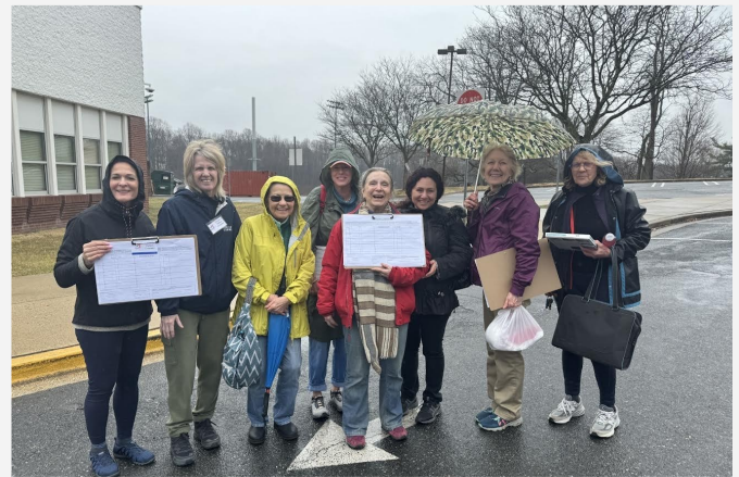
Club members door knocking in support of 2 terms only for County Executive

Club members also had a fantastic time at CPAC in February. Attendees are fired up for the upcoming Presidential election which is critical to the future of this great country. Some of the favorite speakers were Kari Lake, Governor Kristi Noem and, of course, President Donald Trump!