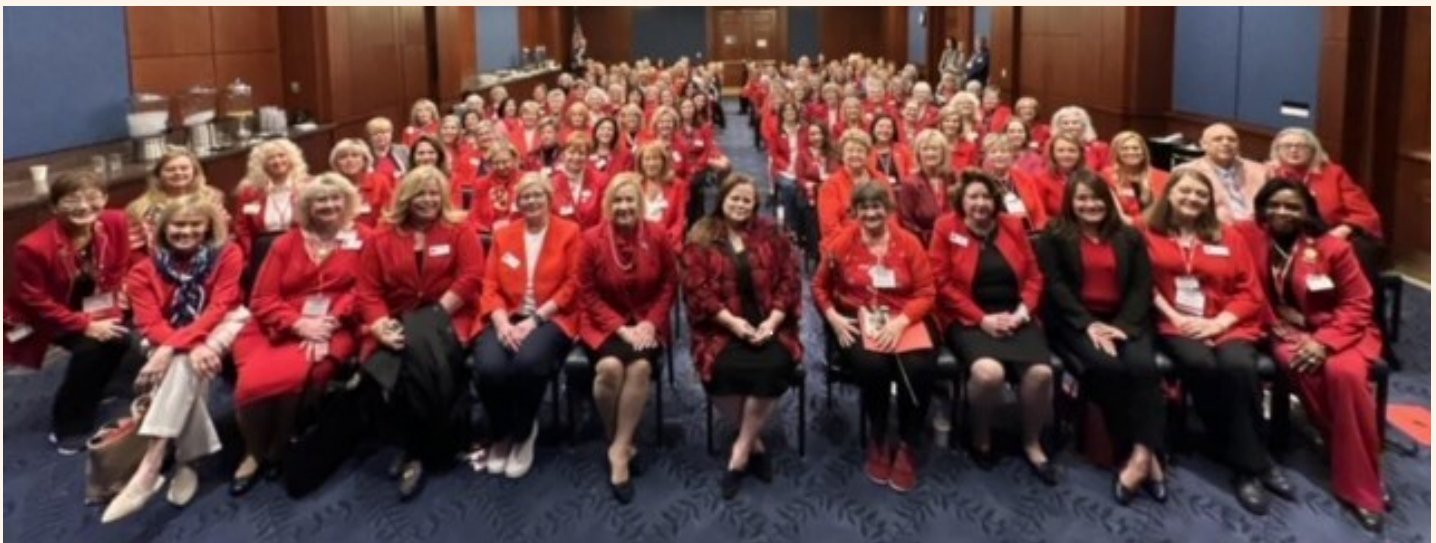
A packed room in the U.S. Capitol Visitors Center for the morning session of the Legislative Day

Notably absent from this year's meeting were any high-profile speakers, which have been interspersed among the business agenda in years past.