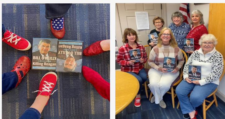
Members of the RWWC enjoying their Red Shoe Book Club meeting to discuss "Killing Reagan."

On Tuesday, January 9, 2024, the Republican Women of Worcester County held their bi-monthly Red Shoe Book Club meeting at the Ocean Pines Library. Books are selected through the Mamie Eisenhower Library Project list. In January they read "Killing Reagan" by Bill O'Reilly.